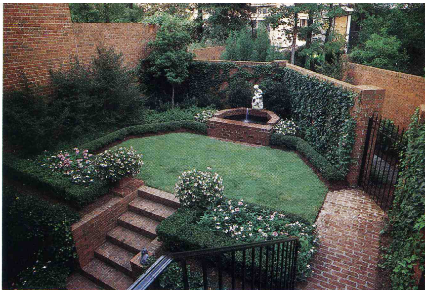
Behind an Atlanta townhouse lies this quaint little garden designed with the past in mind.

As in many of the urban gardens of Savannah, the pool has a fountain. Its refreshing gurgle gives the garden a restful feeling and makes the city sounds seem far away. Evergreens planted behind the pool's 5-foot brick wall will grow to screen adjacent buildings from view.